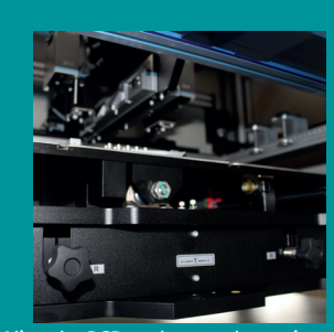
Align the PCB to the template using adjustment screws on the X / Y / R axes